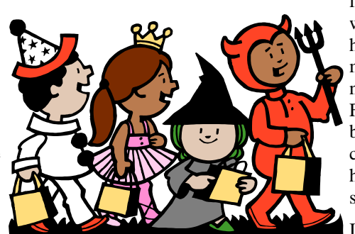
"A Nightmare on 2nd Street" is set for October 19, 20, 26 and 27 at the Second Street Community Center.

Last year's spook-a-rama had 7 scenes with long, pitch black corridors linking each. This year's will be expanded to include 10 scenes with things like a woman with no head. That's right a real,