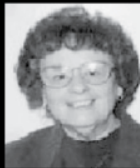
Sally Diehl Rentals/Prop. Mgmt. ext 210

800 North Fourth St. Sunbury, PA 17801 www.squarediehlrealty.com