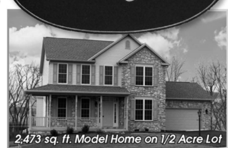
2,473 sq. ft. Model Home on 1/2 Acre Lot