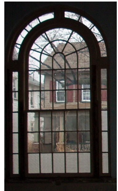
The view through a window at the Second Street Community Center.

The General Contractor is Hepco Construction. This contract includes the outside renovations to the structure, windows, doors, etc. The classrooms at both ends of the gymnasiums are being completed with insulation, new outside walls, and new ceilings. A single handicapped-accessible restroom and janitor's closet are being installed in the wide hallway at the Second Street end of the gymnasium. The Park Avenue side of the gymnasium includes the renovations of the two classrooms, new restrooms, and a remodeled office for recreational purposes. The electrical and mechanical bids were awarded to SRS Electric, LLC and Spencer Mechanic, Inc., respectively. Wolfe Associates, Sunbury, is providing the architectural services. The Community Development Committee meets at 7:00 p.m. on the 4 th Tuesday of the month to discuss future plans for the community center – plan to attend!