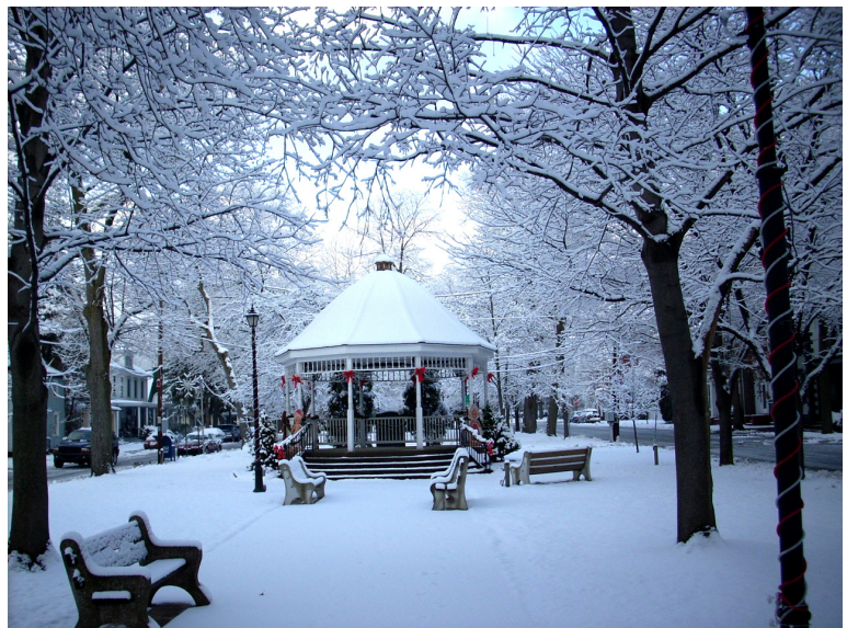
Code Officer Paul Ruane captured this photo December 31, 2007.