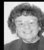
Sally Diehl Rentals ext. 210

800 North Fourth Street Sunbury, PA 17801 www.squarediehlrealty.com