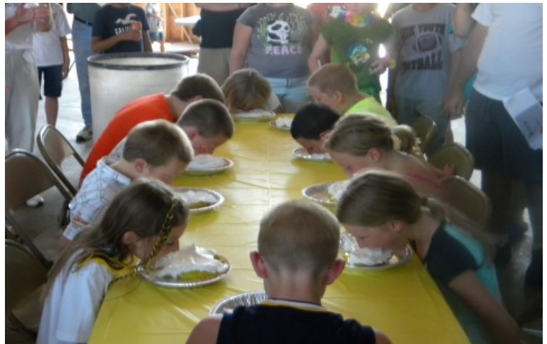
Pie eating contest in progress at Lemonade Day.