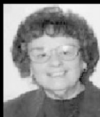
Sally Diehl Rentals ext. 206

800 North Fourth Street Sunbury, PA 17801 www.squarediehlrealty.com