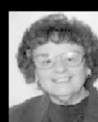
Sally Diehl Rentals ext. 206

800 North Fourth Street Sunbury, PA 17801 www.squarediehlrealty.com