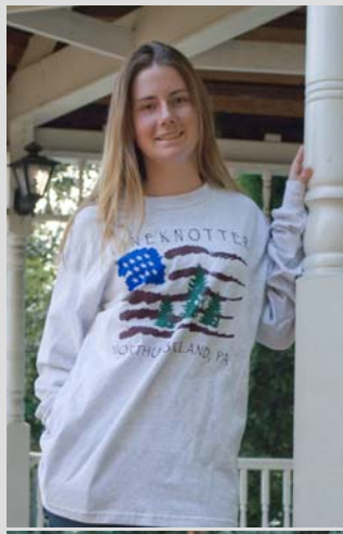
T-shirt with Flag Logo $10- $20 Long or Short Sleeves, Grey or White Sizes from Small to 2X.

Items can be purchased at Pineknotter Days. They are also available each day at the borough office during regular business hours.