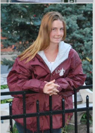
Pine Tree Logo $30 Maroon shell with fleece interior. Sizes from Small to X-Large.